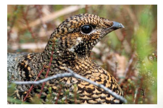
Spruce Grouse