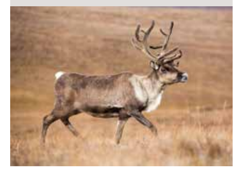
The Arctic Refuge holds the calving grounds of the Porcupine caribou herd.