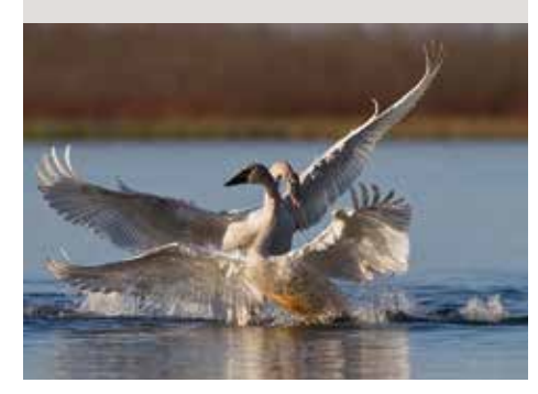
Trumpeter Swans.

Registration for the 2016 Alaska Bird Conference is open. Every two years, researchers and managers convene to report on all aspects of bird biology, management, and conservation in Alaska. The Prince William Sound Science Center is pleased to host the 17th Alaska Bird Conference at the Cordova Center in Cordova, Alaska. For more information or to register visit www.alaskabirdconference.org.