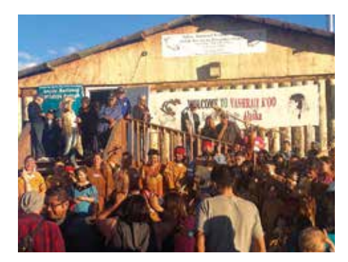
The Gwich'in Gathering brings people together to celebrate their culture.

As the Policy Associate for Audubon Alaska, I recently spent five days at the Gwich'in Gathering in remote Arctic Village. The Gwich'in are a First Nation people from the Yukon River flats of northwestern Alaska and Canada's Yukon and Northwest territories. They gather every other year to maintain ties with family and friends; keep traditional food, dance, and language thriving; and tend to the governance of their Native nation.