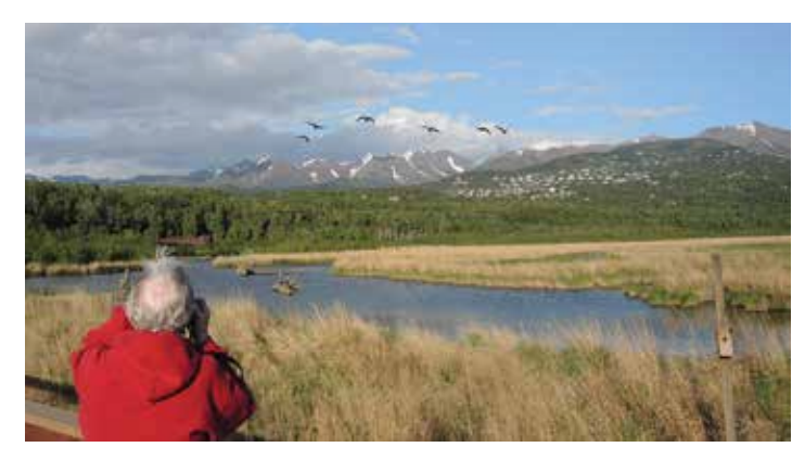
A walk at Potter Marsh in the Anchorage Coastal IBA.

As we finish these summer walks, I leave with a much deeper understanding of the ecology and bird life right here in our backyard. Just as importantly, I have a greater appreciation for the birding community in Anchorage and the wonderful individuals who create it. ■